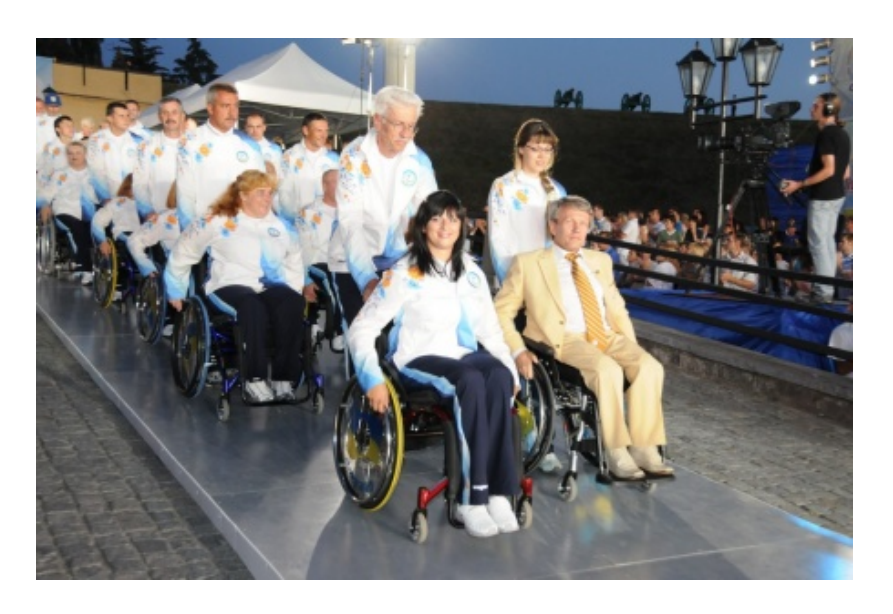
Figure 5: Image Source NADU Ukraine Photo Gallery