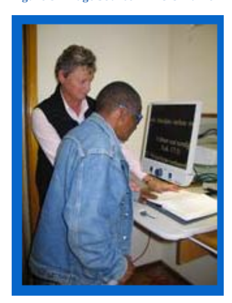
Figure 6.