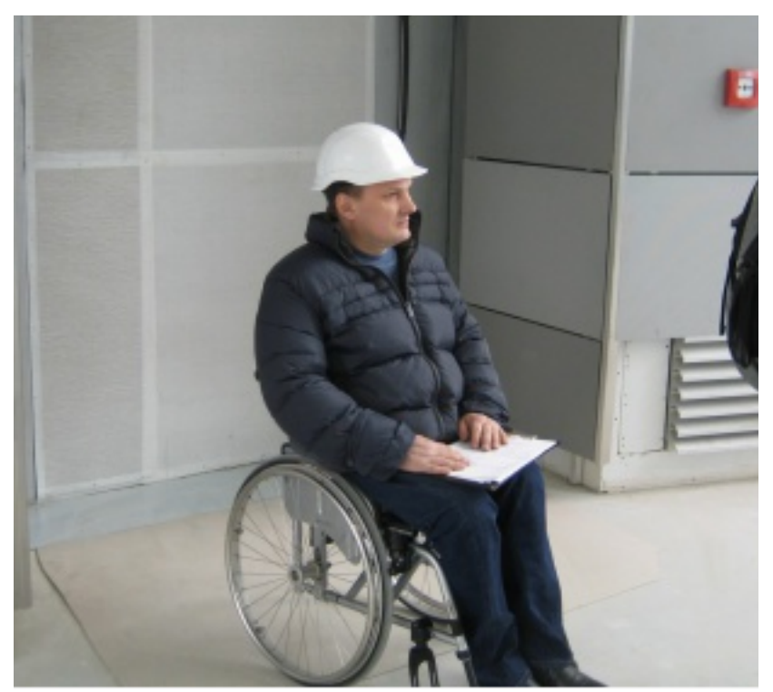
Figure 3.