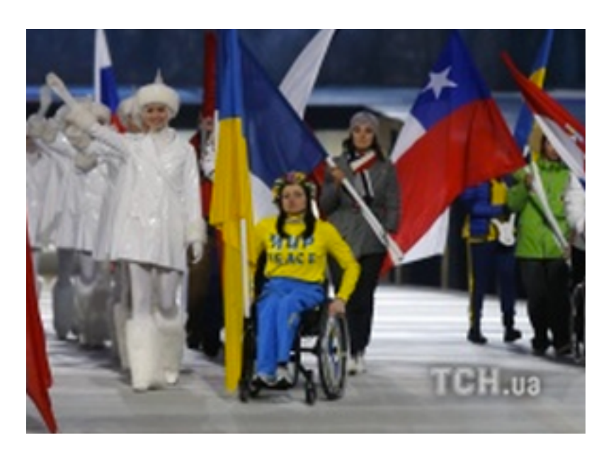
Figure 4: Image Source NADU Ukraine Photo Gallery